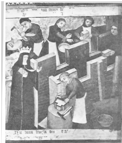
PLATE 2: Masons building a Church at Ely

This type of apron, with later the skin of the head of the animal forming a bib, seems to have been in use for all types of heavy workers, including of course masons, for several centuries.