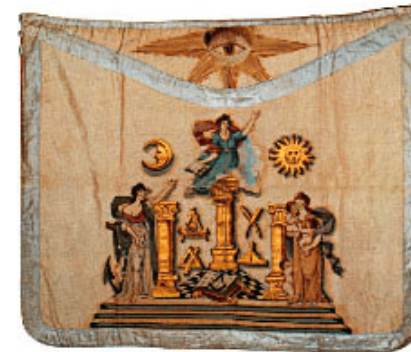
figure 5. Satin Apron, English, c. 1800.