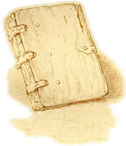
Quatuor Coronatorum Antigrapha

such congregations and be rebell[ious], and will not come, or else have trespassed against any Article before said, if it may be proved, he shall for- swear his Masonry and shall no more use his craft; the which, if he presume for to do, the Sheriff of the Country, in which he may be found working, he shall [im]prison him and take all his goods into the king's hand till his grace be granted him and shew- ed. For this cause, principally, where these congregations ordained that as well the lowest, as the highest, should be well and truly served in his art, before said, through- out all the kingdom of England. Amen: So Mote it be.